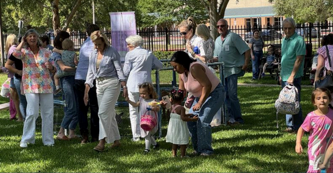
Residents And Families Enjoying Easter Celebrations!