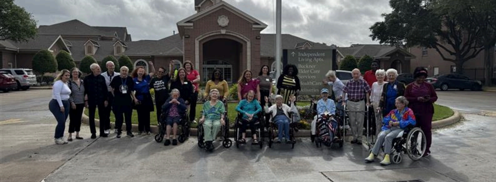
Residents From Independent And Healthcare on National Walking Day!