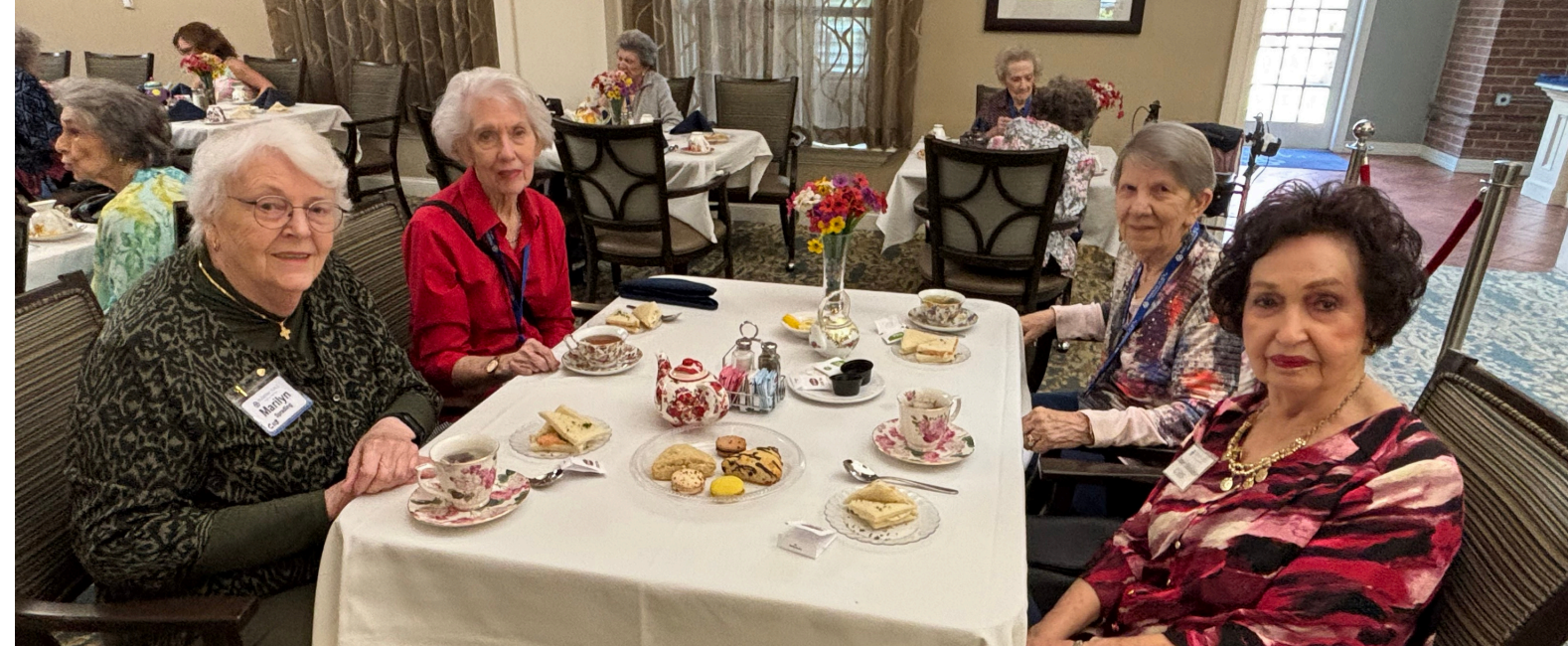
Resident Engaging In Great Fellowship!