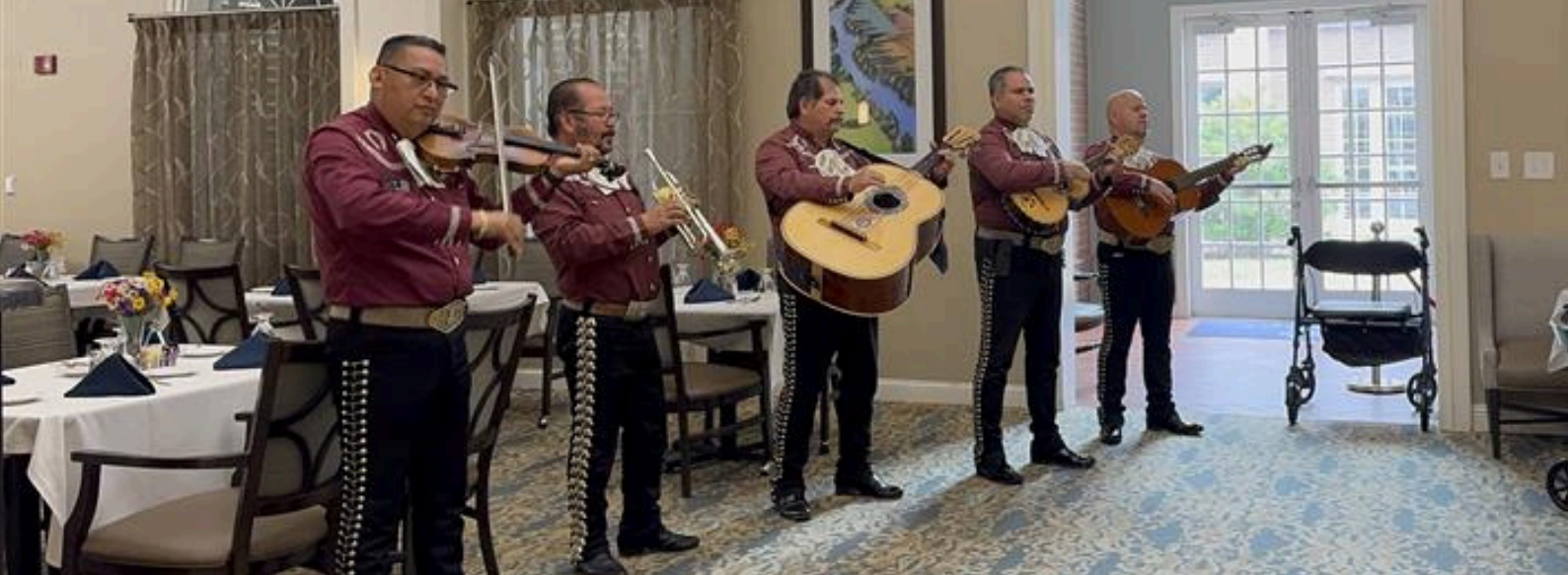
Residents Celebrating Cinco De Mayo With A Mariachi Band!