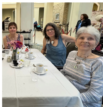
Residents Enjoying Mother's Day Tea With Their Daughters!