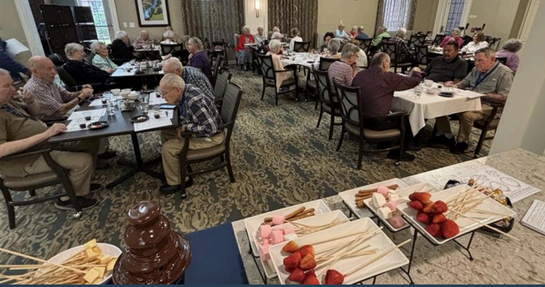
Resident's Enjoying A Chocolate And Wine Tasting!