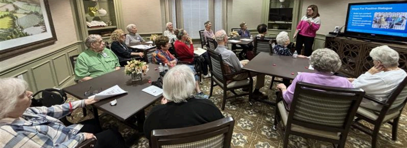
Residents Listening To A Lecture On Dementia.