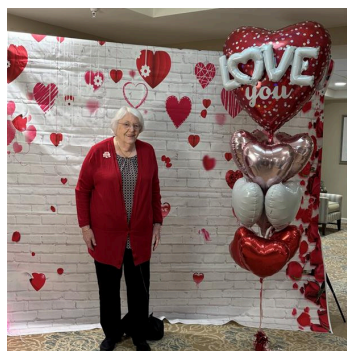
Residents Enjoying Valentine's Day Celebrations!