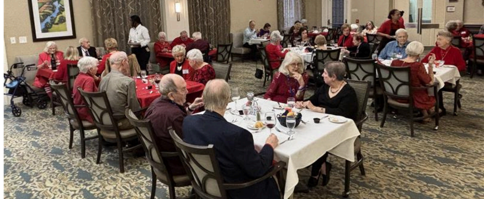
Resident's Enjoying Valentine's Day Celebrations!