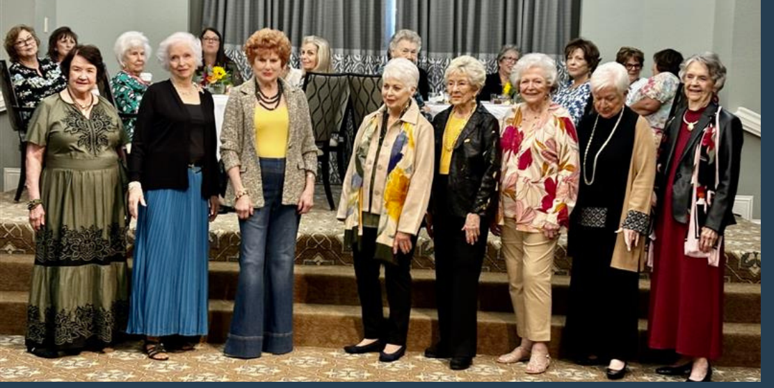
Residents Modeling For Chico's Fall Fashion Show!