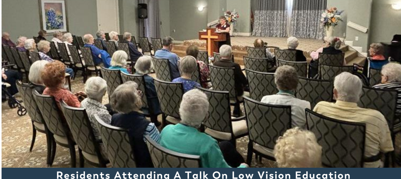
Residents Attending A Talk On Low Vision Education