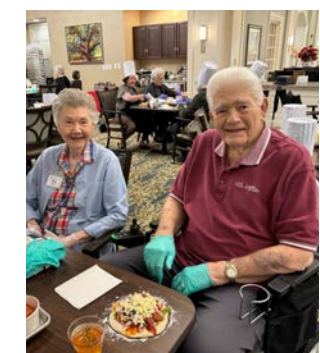
Build Your Own Pizza!