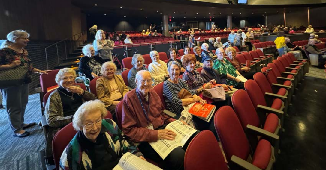
Residents At The Stratford High School Playhouse!