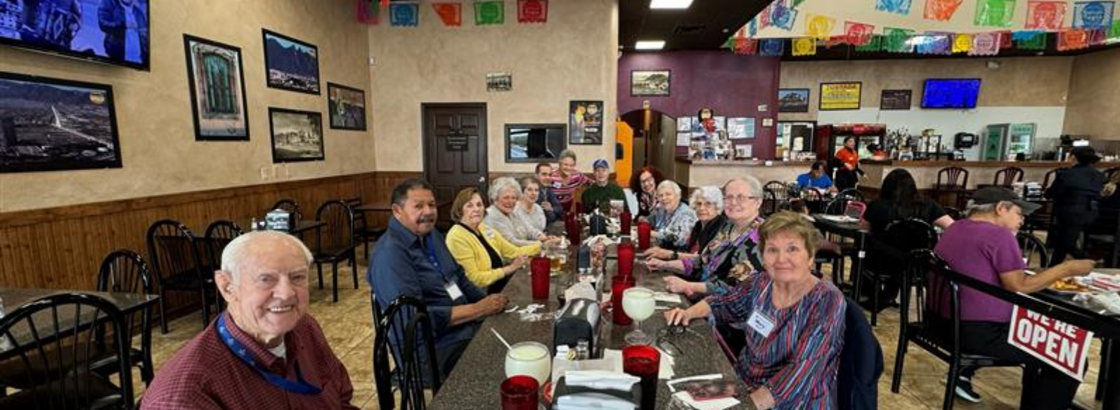
Spanish Club Outing To Tostada Regia!