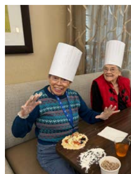
PWP's Newest Chefs!