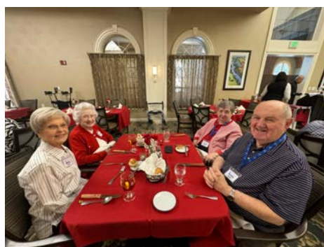
Valentine's Day Dinner Party Fun!