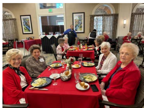
Smiling on Valentine's Day!