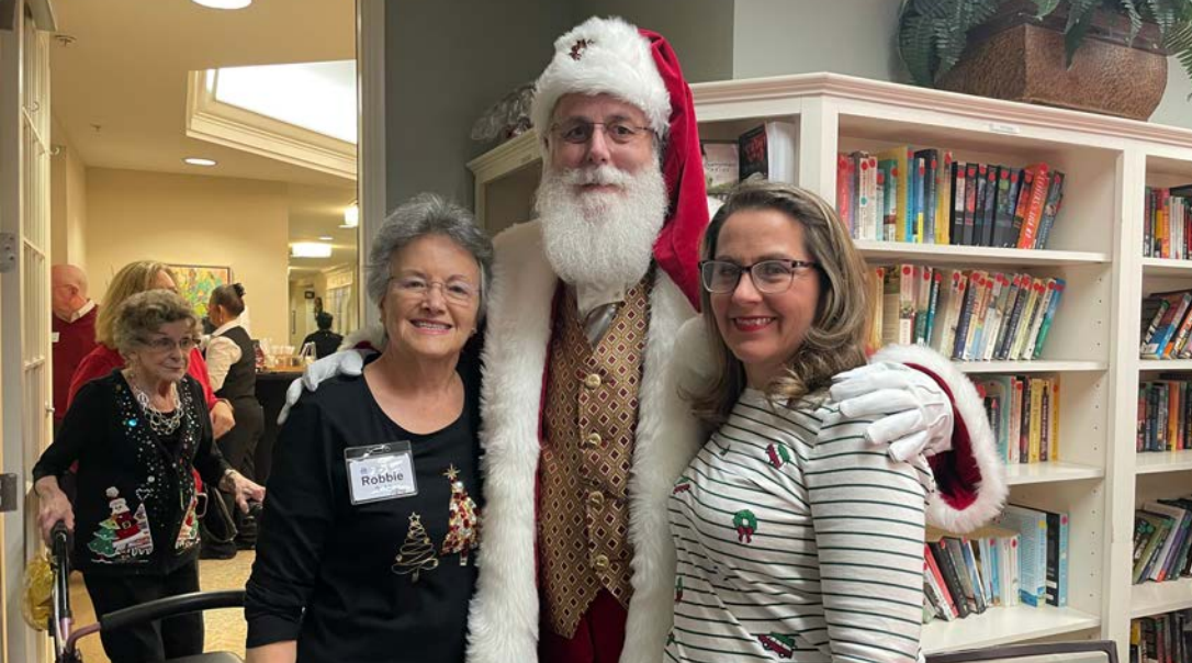
Residents and their families got together to celebrate Christmas!