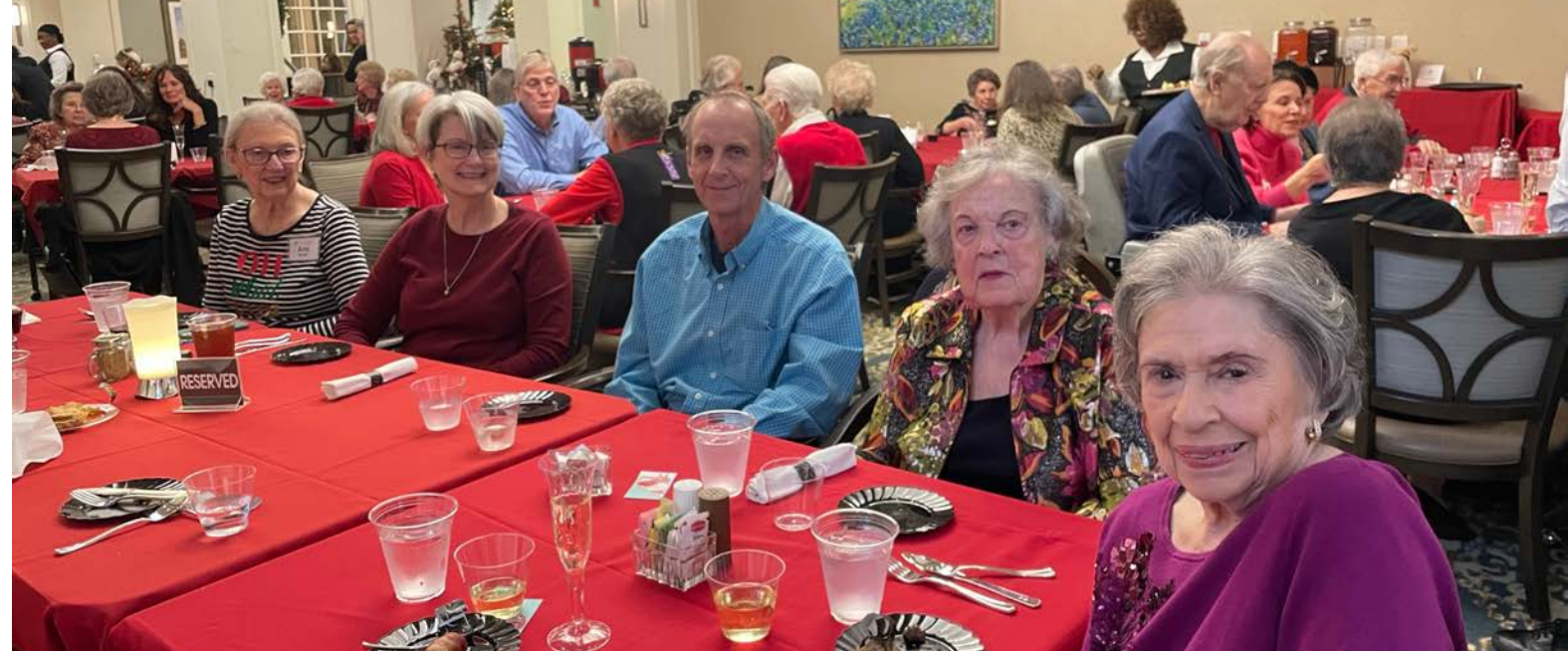
Residents Enjoying The Parkway Place Christmas Party!