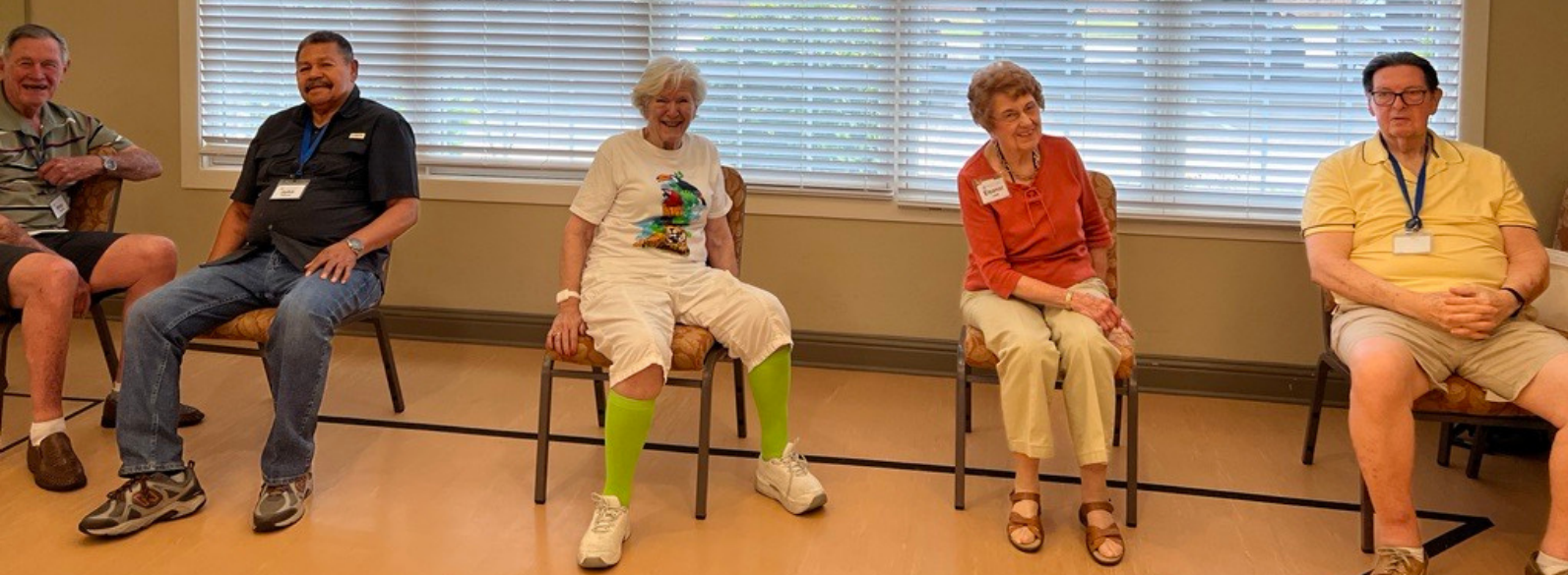
Residents Stretching Their Minds During Cognitive Calisthenics!