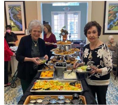
Residents Love Being Active At Parkway Place!